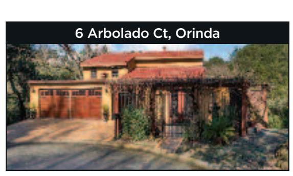
Mediterranean Remodel • $1,050,000