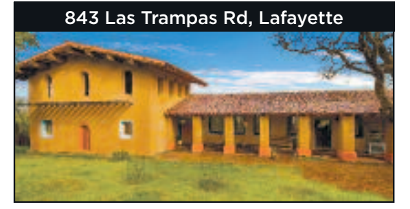
Spanish Hacienda • $1,695,000