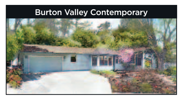
Coming in Mid-March