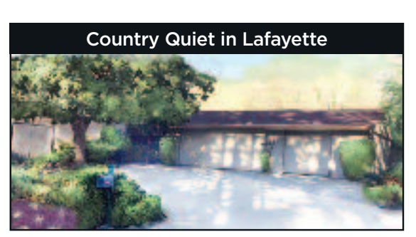
Coming in Early March