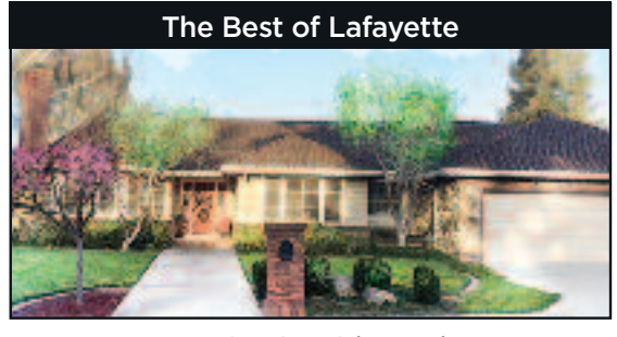
Coming in Mid-March