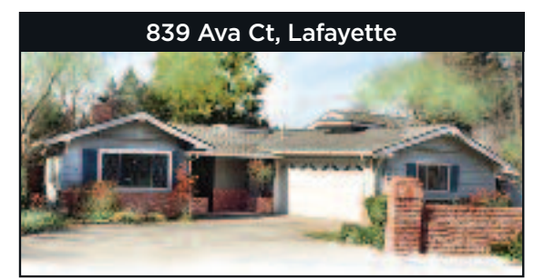
Quite Court in Trail • $1,325,000