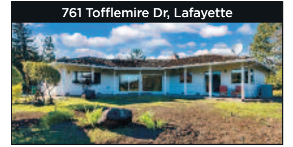
1.55± Acre Lot • $1,699,000